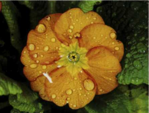
Fujicolor IT-N dupe.

mon reason for corrective slide duplication. If your slides are overexposed, there is very little you can do, as the image detail in the washed-out areas in the image is gone and can't be easily retrieved. On the other hand, underexposed slides still have a great deal of image information, and can be corrected by increasing the exposure in the duplicate slide. We have original slides so dark that you could barely see any detail, yet the slide duplicate looked like any other properly exposed slide.