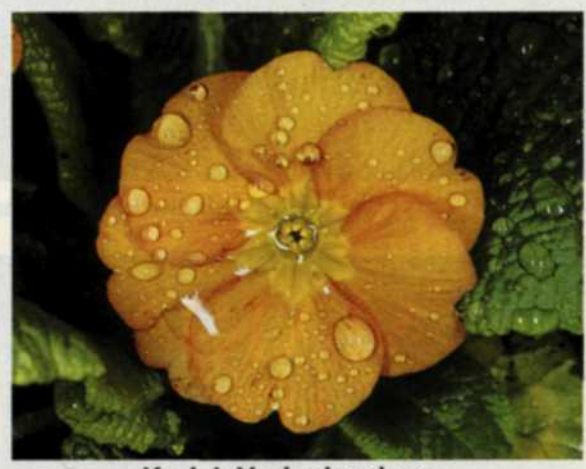
Kodak Vericolor dupe.

Older original slides may start to fade at an accelerated rate due to the loss of