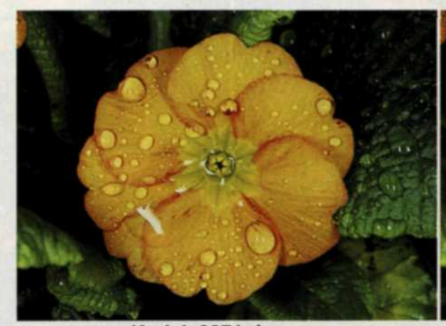
Kodak 8071 dupe.