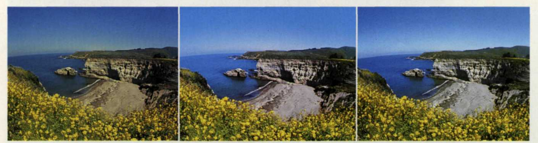
Kodak 8071 dupe.