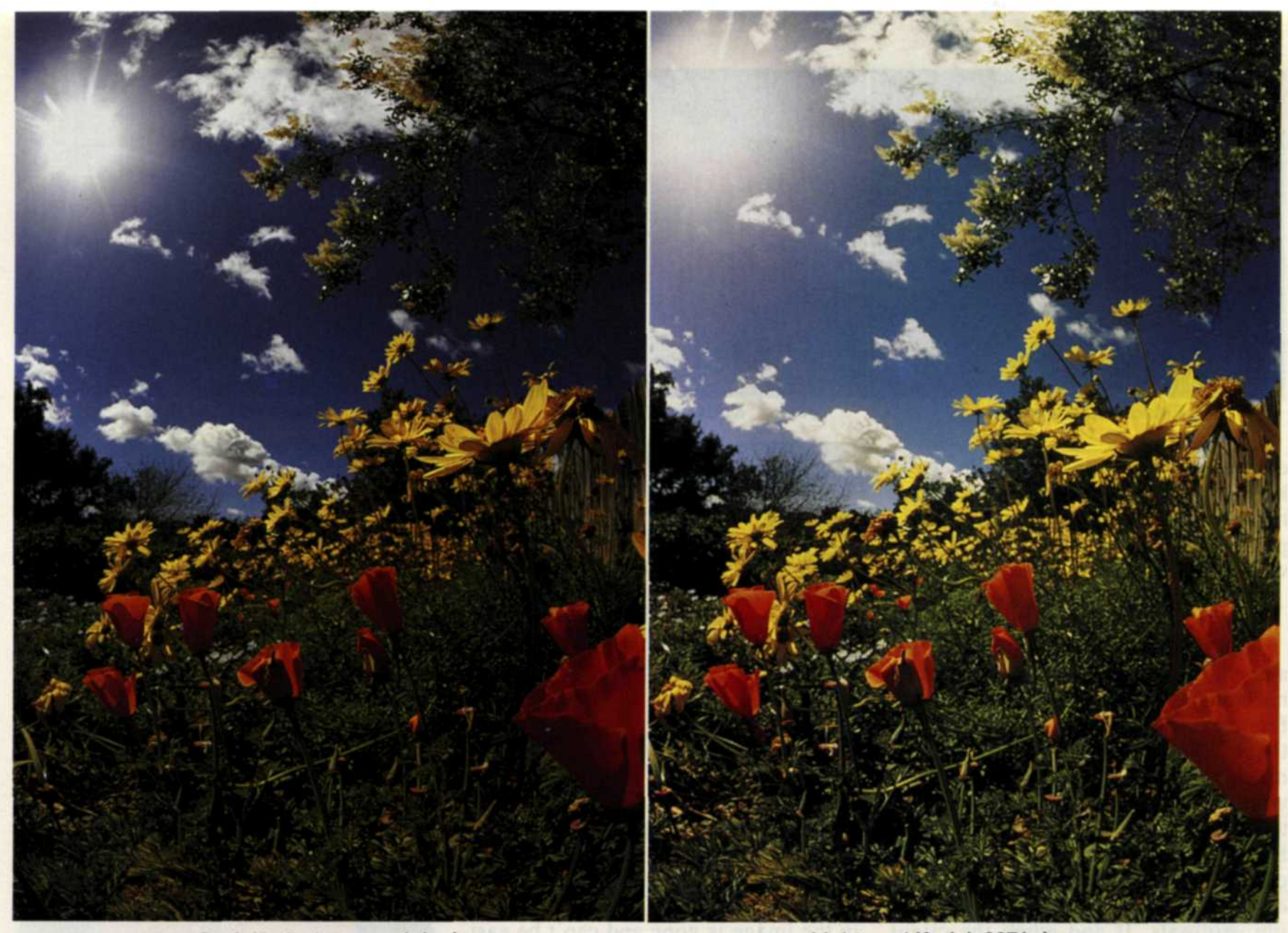
Dark Kodachrome original.